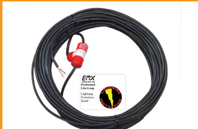
PR-XX (light preformed loop with lighting protection)

The ULTRAMETER™ display makes installation, set-up and troubleshooting easy. Each time a vehicle is moved onto the loop, the display indicates the sensitivity necessary to detect vehicle. Simply set the sensitivity to the value displayed to detect the vehicle. Interference or crosstalk from adjacent loops or other sources are displayed as a constantly varying number on the ULTRAMETER™. This condition may be avoided by maintaining a minimum of 5 kHz separation in multi-loop applications.